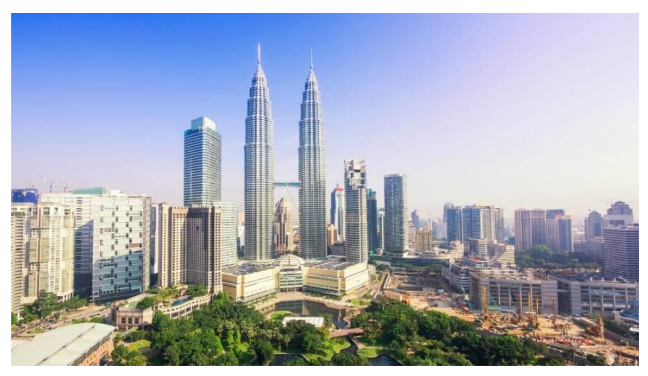
A picnic in the park or enjoy a helicopter ride around the city

Fortunately, the city has an array of romantic restaurants ranging from the usual cafes, to sky dining. Together, couples can get a sample and share delicious meals. Part of the excitement is to experience different cuisines and flavours. To take it a step further, check out Le Petit Chef where an animated tiny chef cooks your dishes right in front of you! Even a simple picnic at a park or by a lake can put a sizzle in your romance.