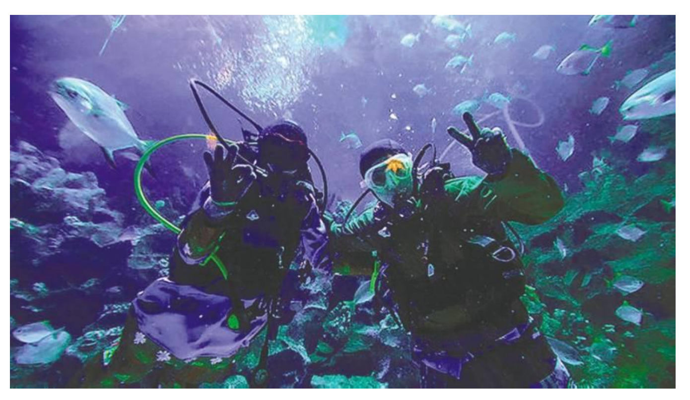
Test your love - and your nerves - with a dive with sharks at Aquaria KLCC

Couples looking for something different from the usual dinner plans should seek out experiences. It could be diving with the sharks in Aquaria or attending concerts and theatre shows. Couples can even try joining a dance night, have a good laugh at comedy shows or sign up for a Sip and Paint session. Although not a must, a once in a lifetime helicopter ride with a view of the city they fell in love in can be a grand romantic gesture too.